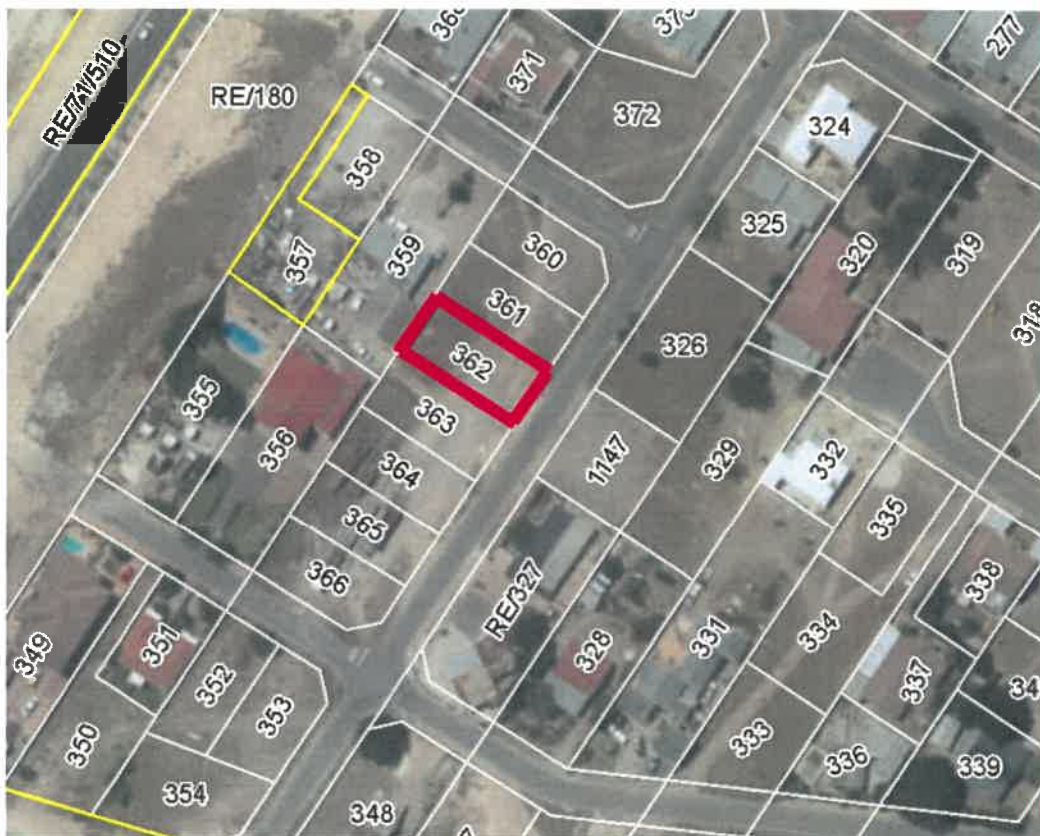
The above aerial photo shows the property in the contexts of its surrounding environment

The property is currently vacant. An adjacent owner from time to time use these vacant erven to park his trucks. This is however done illegally and without the consent of the property owner.