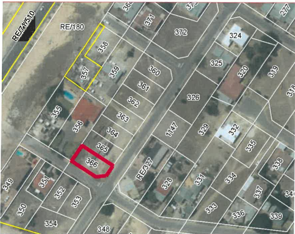
The above aerial photo shows the property in the contexts of its surrounding environment

The property is currently vacant. An adjacent owner from time to time use these vacant erven to park his trucks. This is however done illegally and without the consent of the property owner.