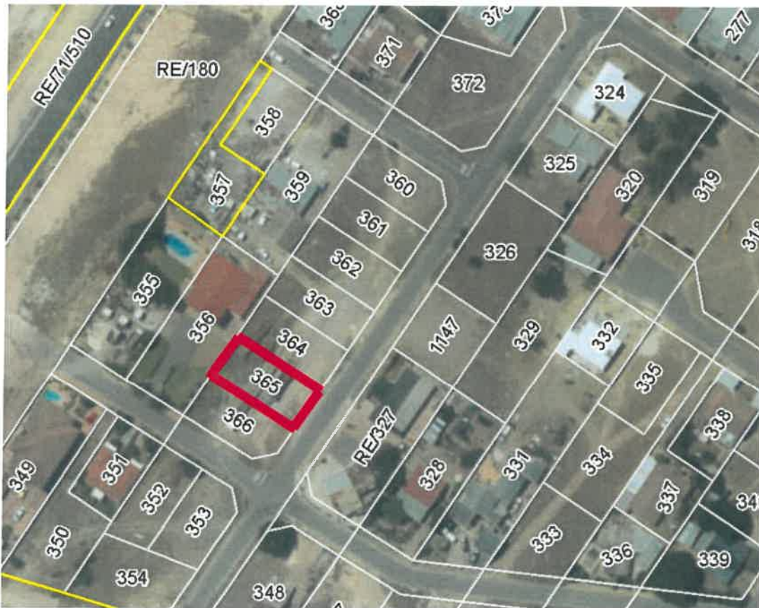
The above aerial photo shows the property in the contexts of its surrounding environment

The property is currently vacant. An adjacent owner from time to time use these vacant erven to park his trucks. This is however done illegally and without the consent of the property owner.