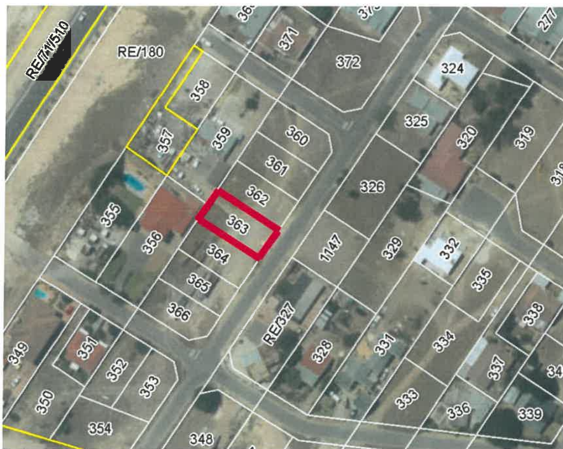
The above aerial photo shows the property in the contexts of its surrounding environment

The property is currently vacant. An adjacent owner from time to time use these vacant erven to park his trucks. This is however done illegally and without the consent of the property owner.