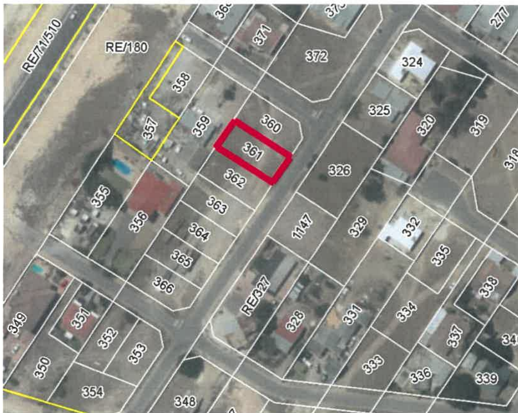
The above aerial photo shows the property in the contexts of its surrounding environment

The property is currently vacant. An adjacent owner from time to time use these vacant erven to park his trucks. This is however done illegally and without the consent of the property owner.