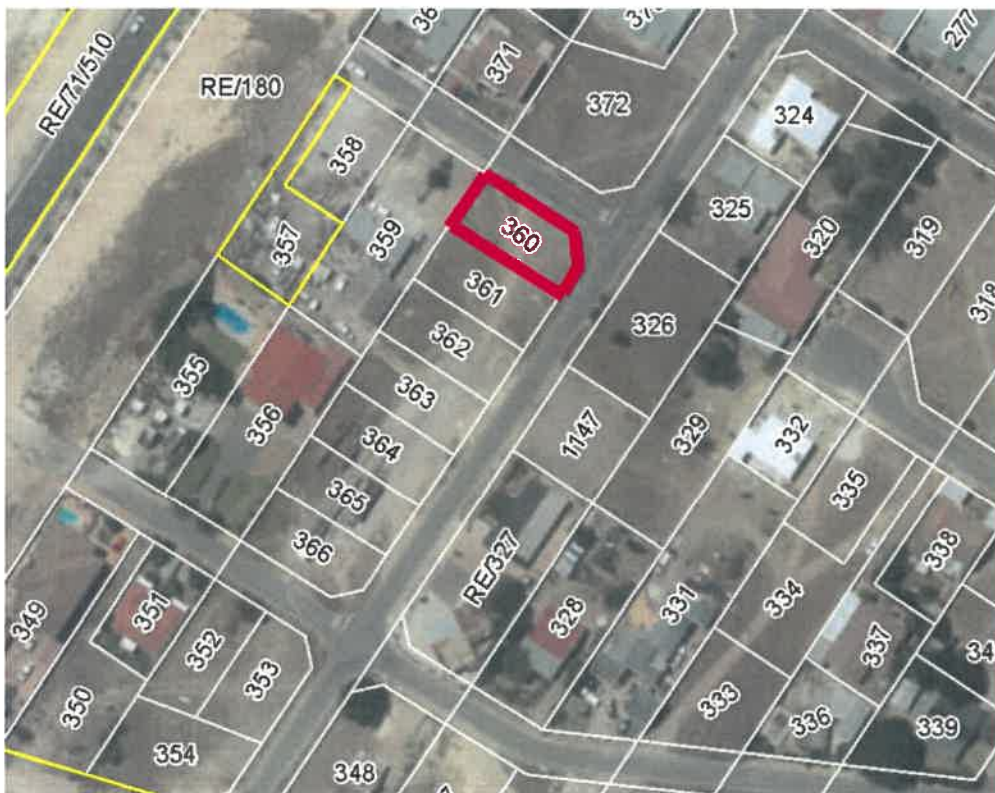
The above aerial photo shows the property in the contexts of its surrounding environment

The property is currently vacant. An adjacent owner from time to time use these vacant erven to park his trucks. This is however done illegally and without the consent of the property owner.